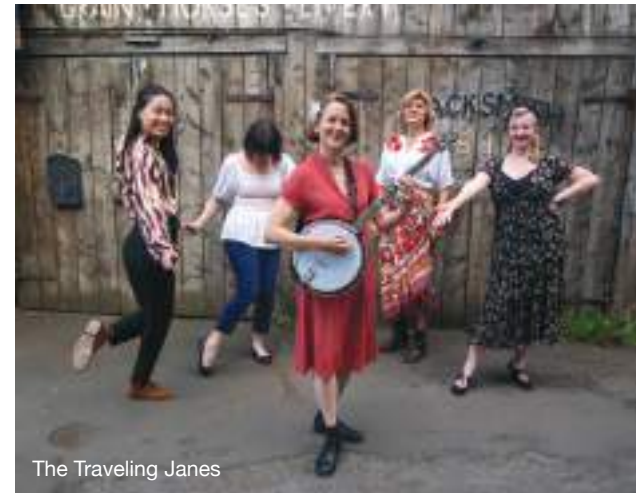
The Traveling Janes

in the early jazz and blues scene. The music that launched the careers of the likes of Louis Armstrong and Ma Rainey is presented with all the joy and originality of the vaudevillians of old.