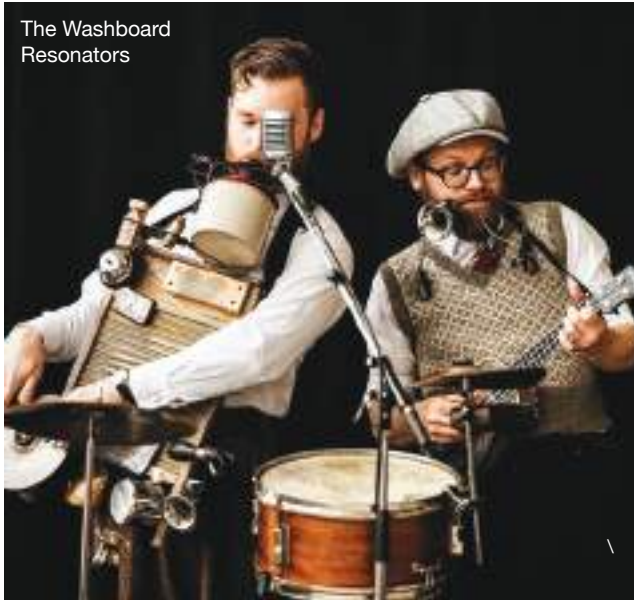
The Washboard Resonators

Back in 1980 Willy and the Poor Boys were one of the most highly prized bands on Big Bear's Live at the Barrel Organ album. Sadly, despite a highly successful career for the few years, it was other bands that broke through and ultimately Willy and the Poor Boys disbanded. Fast