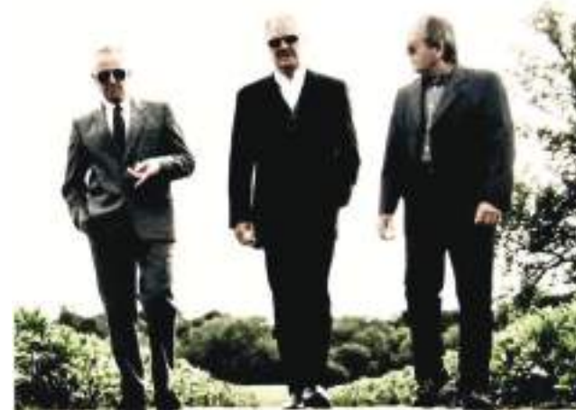
The Dirt Road Band