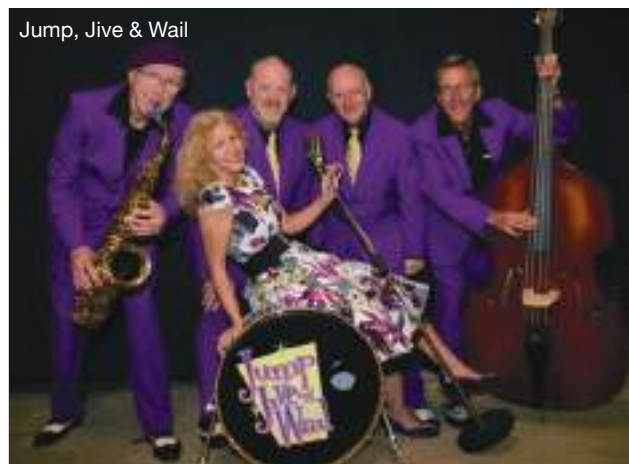
Jump, Jive & Wail

18:00 DOUBLE TREE BY HILTON COVENTRY B.D. LENZ (USA)