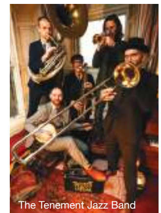
The Tenement Jazz Band

The Traveling Janes have many different things to recommend them, not least the fact that a four-piece band contains members from Scotland, the United States, Singapore and Norway – plenty of travelling involved, though the name 'Traveling Jane' actually refers to a slang phrase given to a female performer from the late 19th/early 20th century vaudevilian travelling tent shows. This is an international band of seasoned and award winning performers who have all carved out respected, solid profiles