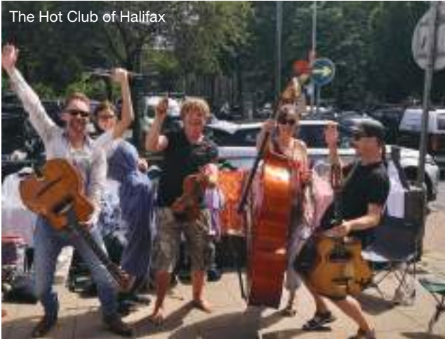
The Hot Club of Halifax

betrayal, gambling, liquor and redemption. After self-releasing their debut album, the band have released a further seven albums.